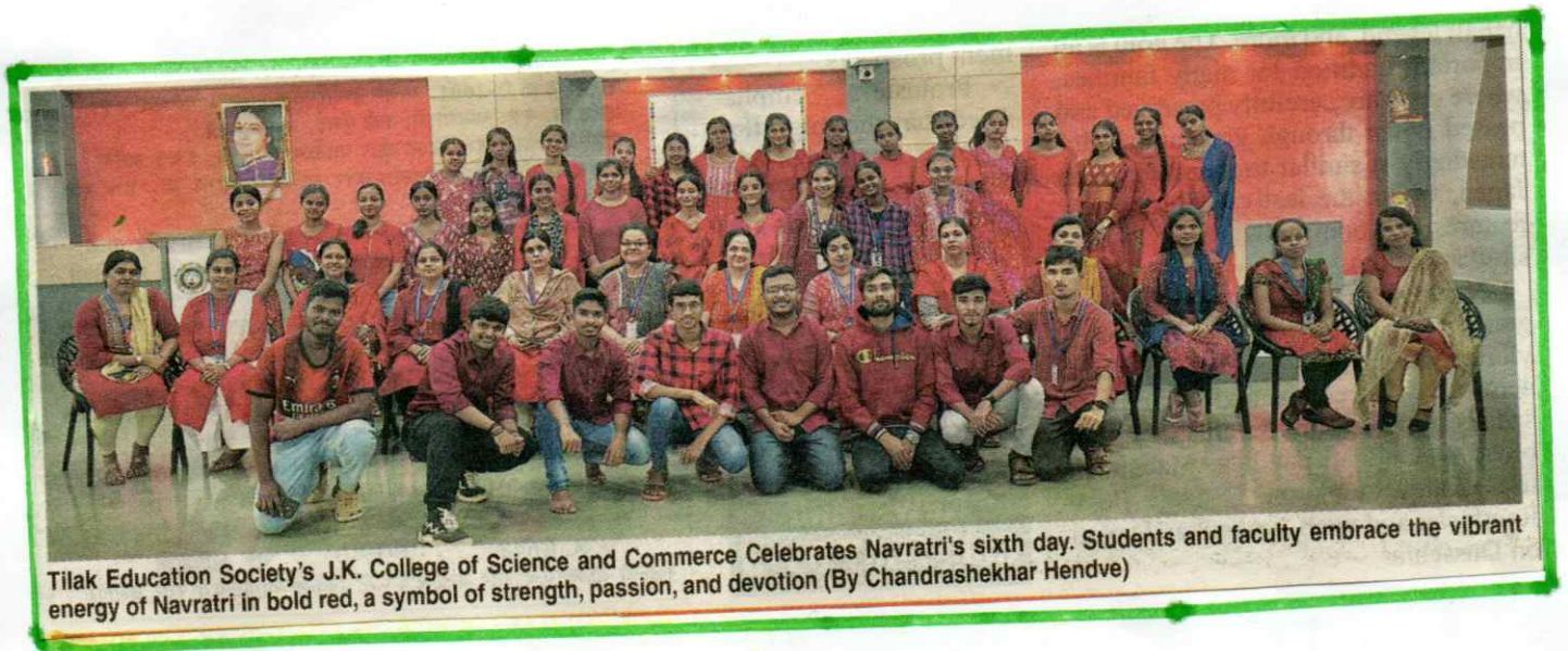
Tilak Education Society's J.K. College of Science and Commerce Celebrates Navratri's sixth day. Students and faculty embrace the vibrant energy of Navratri in bold red, a symbol of strength, passion, and devotion