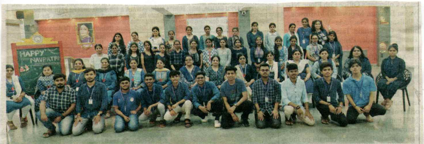
Students and staff of Tilak Education Society's J K College of Science & Commerce, Ghansoli, embrace the vibrant spirit of Navratri by donning blue attire, embodying the divine delight associated with the festival